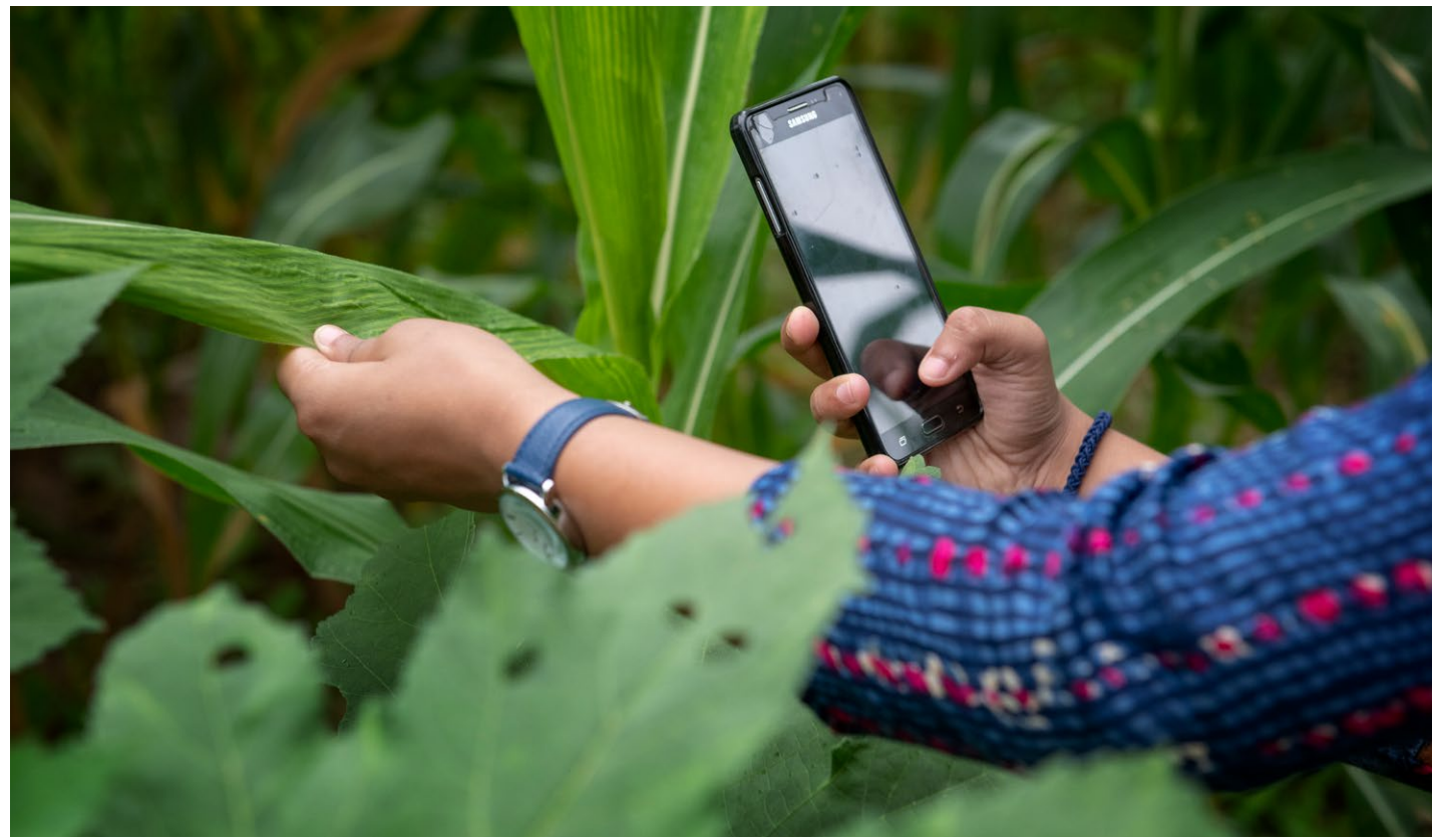
Pratima Baral, researcher at the International Maize and Wheat Improvement Center (CIMMYT) using Plantex app.

For large infrastructure projects that mostly require a larger share of public financing to support climate-resilient development, there are likely many co-benefits in terms of improved public health, for example in public transport and urban planning. Thus, the quantification and inclusion of these technology-driven and 'pandemic-proofing' co-benefits can support the case for scaled-up public investment in projects that explicitly value both national climate and SDG targets and priorities.