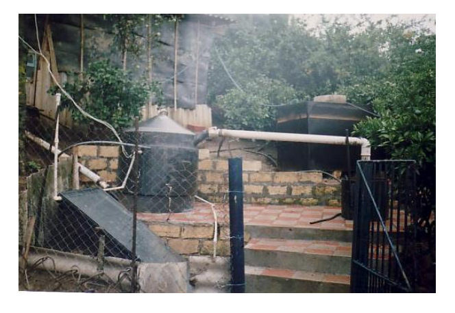
Biogas for heating/cooking