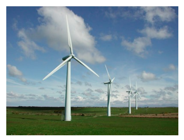
Grid connected wind power