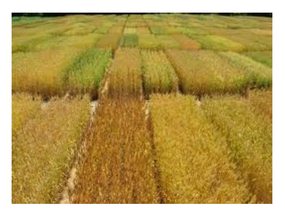
Introduction of drought resistance crop species