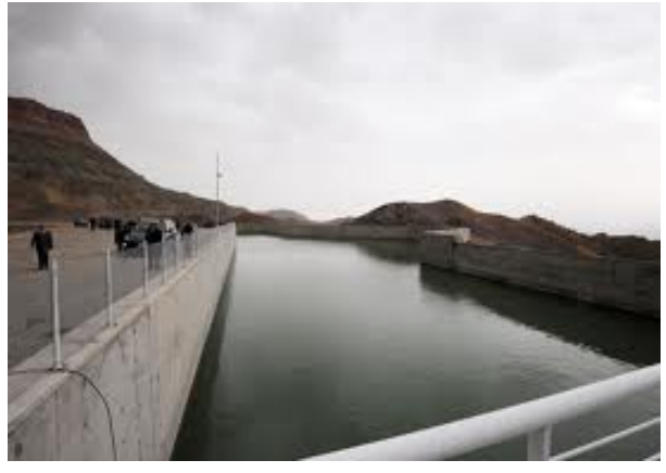
Small hydro powers